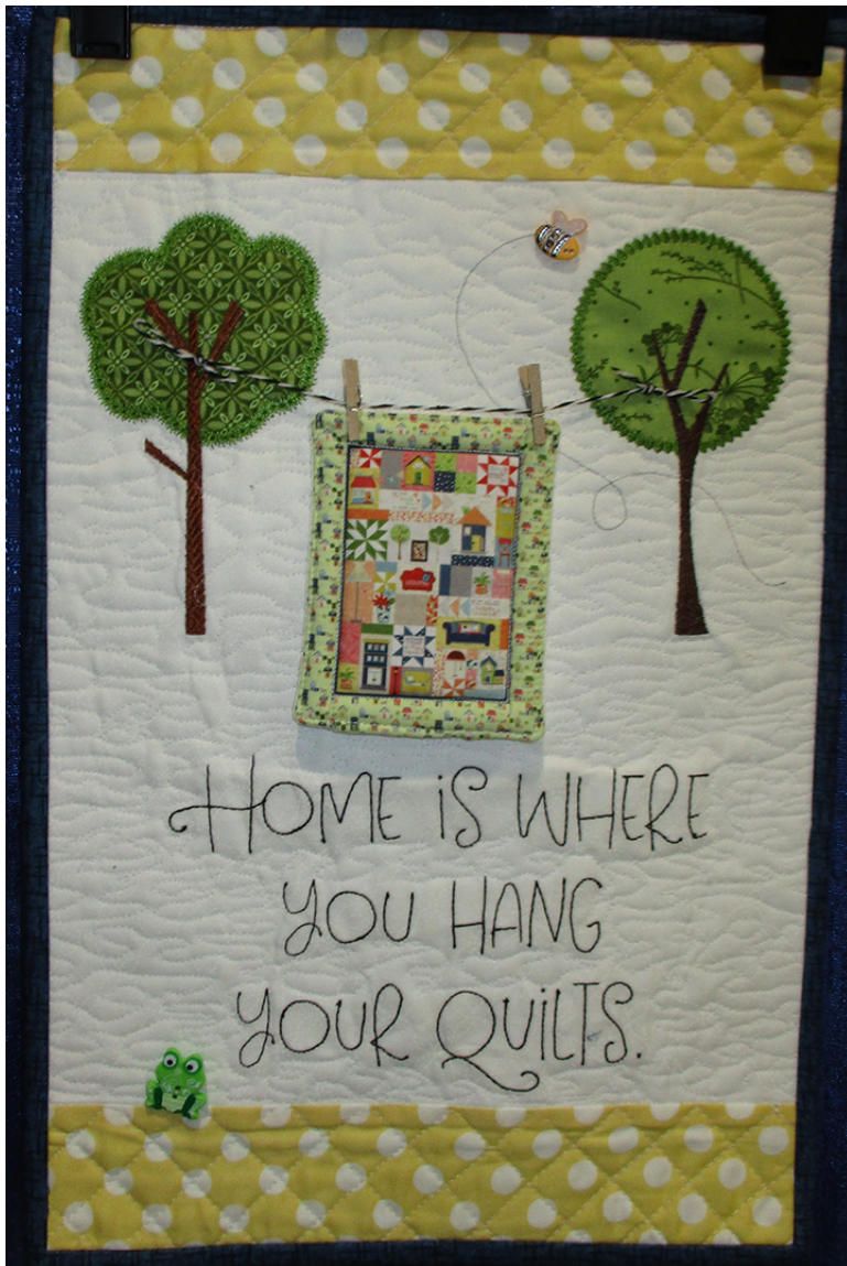
Entrant: Susan B