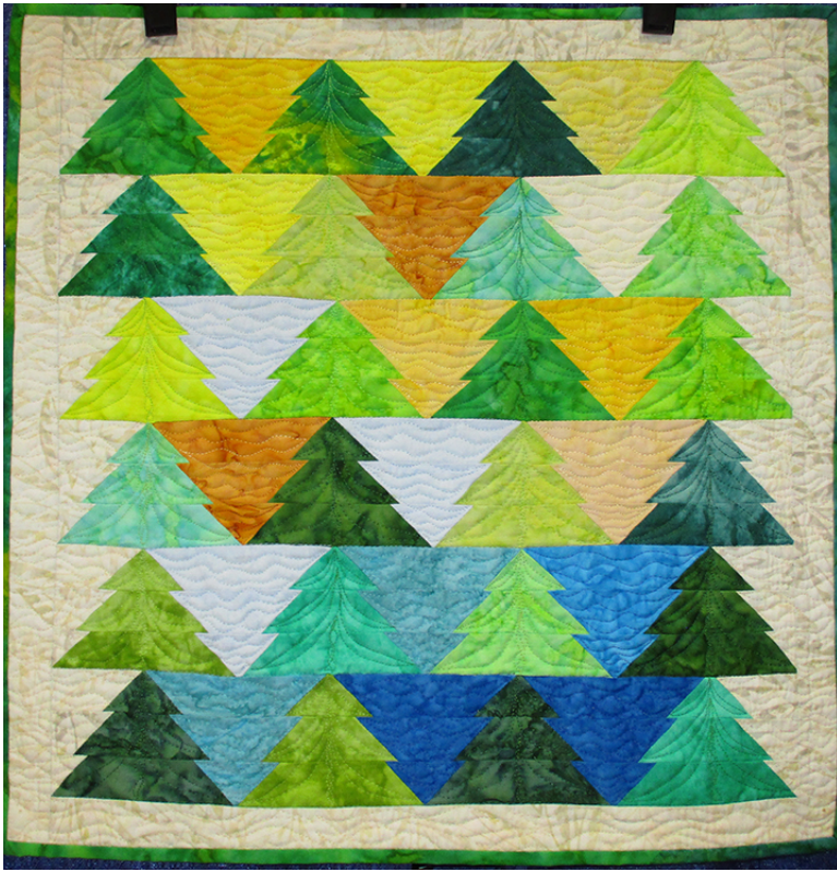
Entrant: Ann A