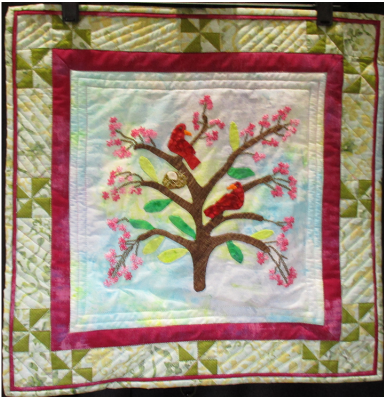
Entrant: Pam D