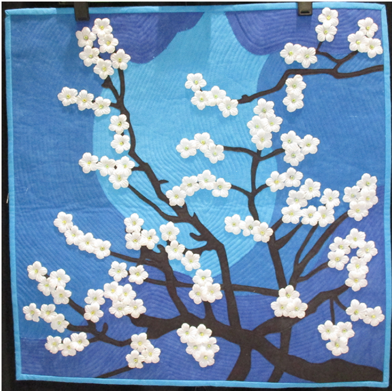
Entrant: Lana K