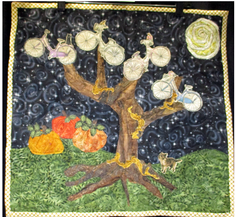
Entrant: Pam H