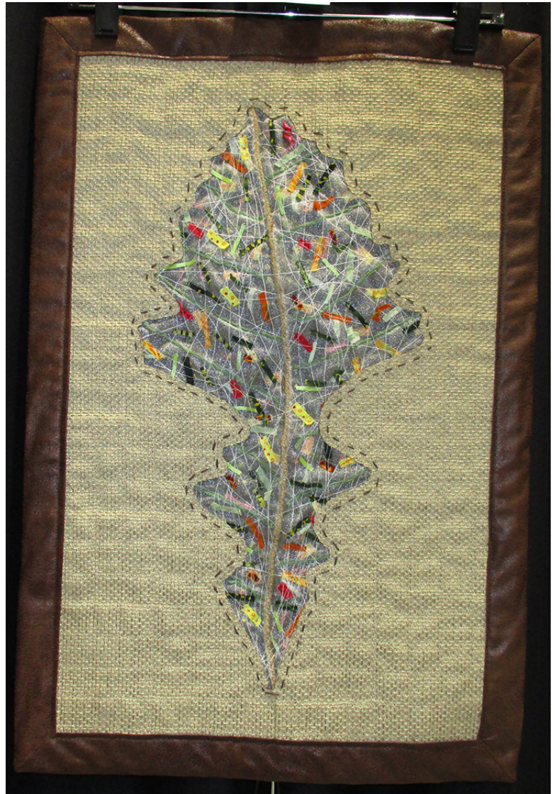
Entrant: Keith W