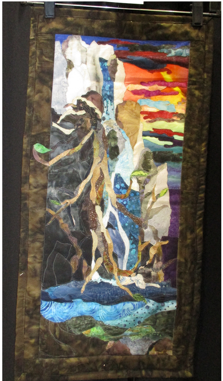
Entrant: Pam S