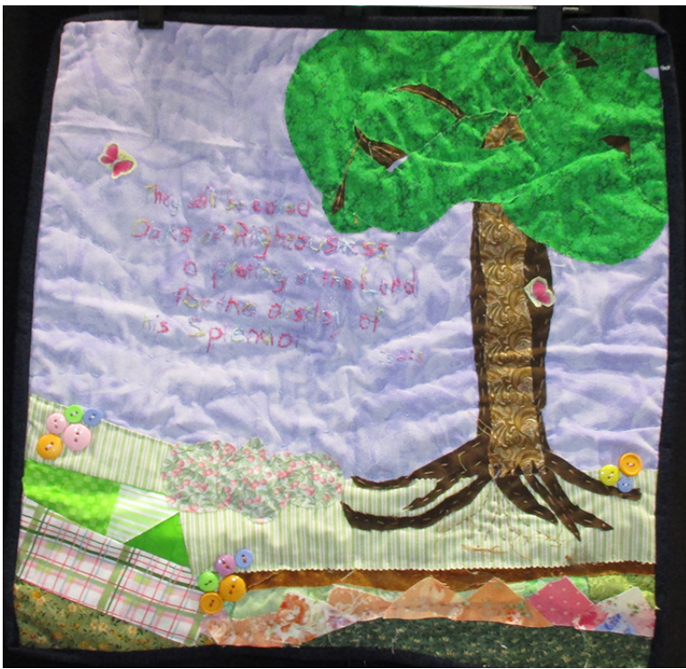
Entrant: Debra F